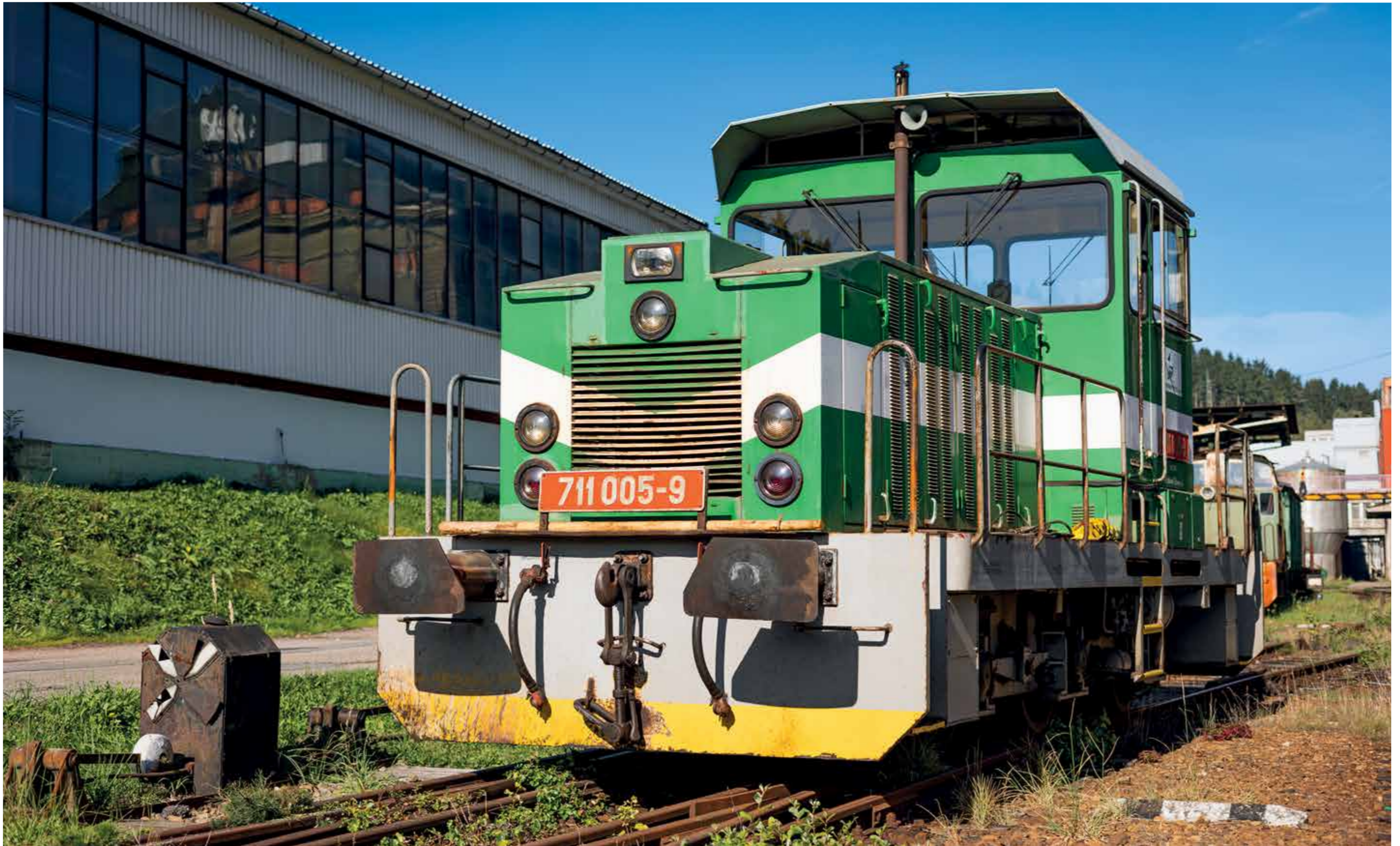
Papírny Větrní | LOKOMOTIVA TYP 711 (1996)