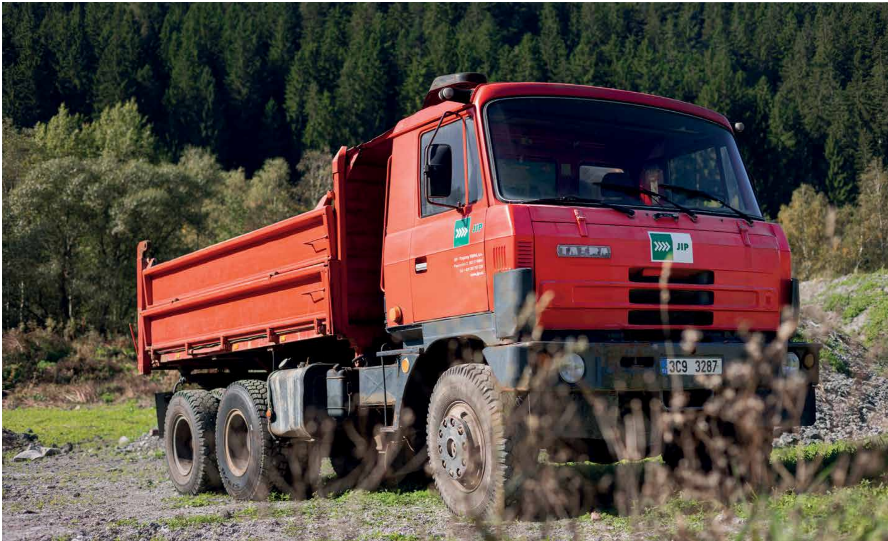
Papírny Větrník | TATRA T815 S3 6x6 (1987)