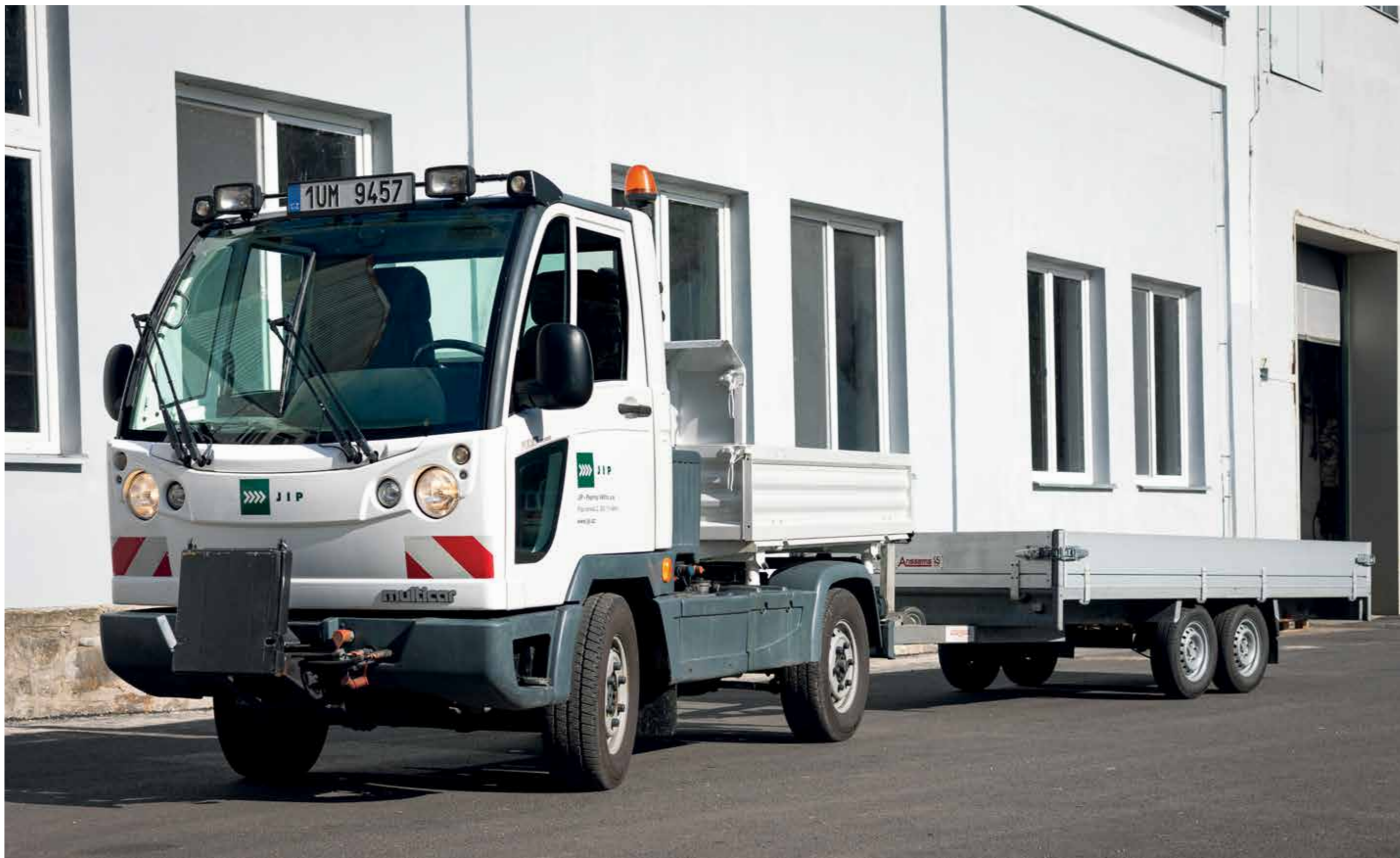
Papírny Větrník | MULTICAR M30 FUMO (2011) + ANSEMS PSX2 (2022)