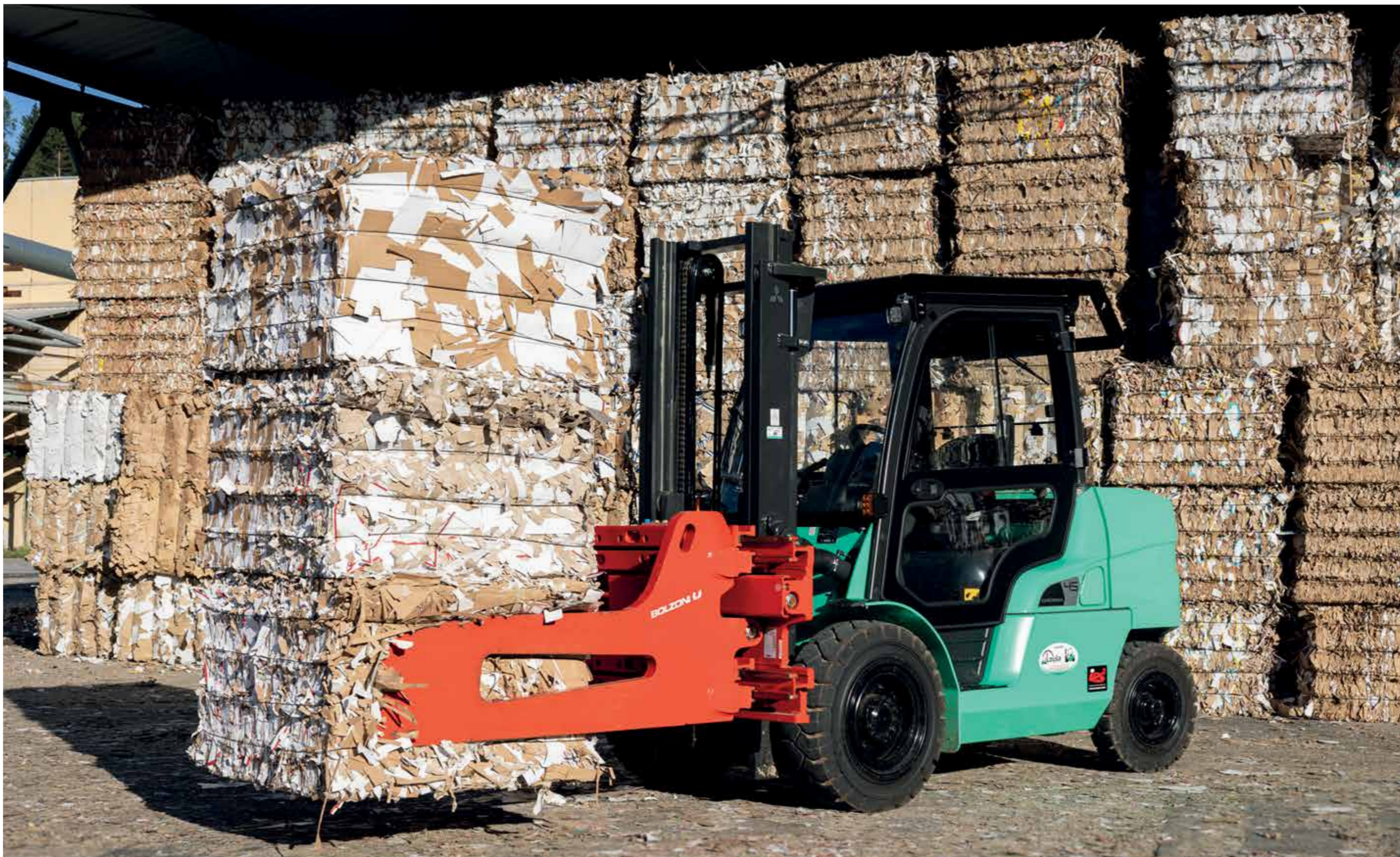
Papírny Větrní | MITSUBISHI FD45 N3 (2023)