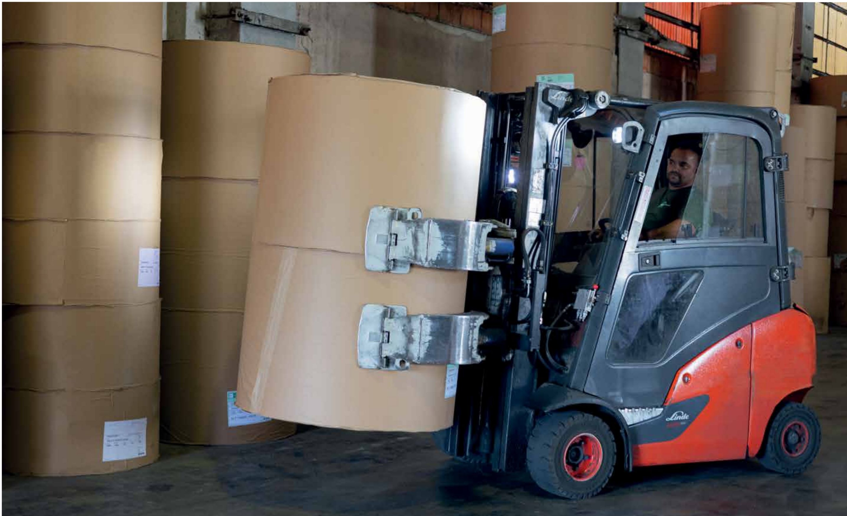
Papírny Větrník | LINDE H20T LPG (2016)